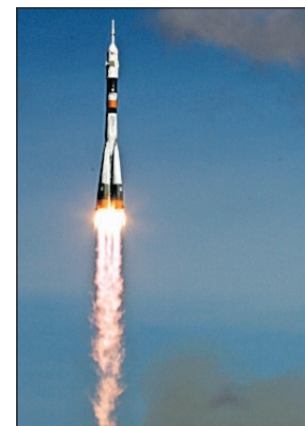
Rocket ride: The Soyuz